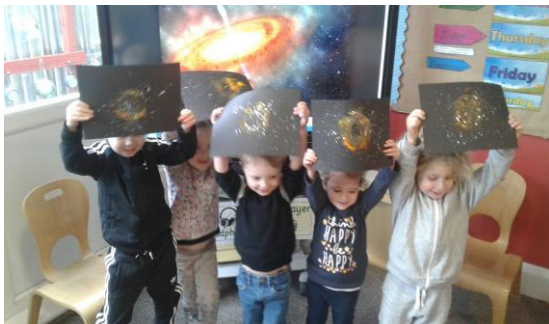
Our space black hole pictures

During the month of March our children also took part in Science week. This was also in memory of Stephen Hawkins. The children took part in different activities such as painting black hole pictures, researching space on our interactive boards, creating their own bubbles and making sensory bottles.