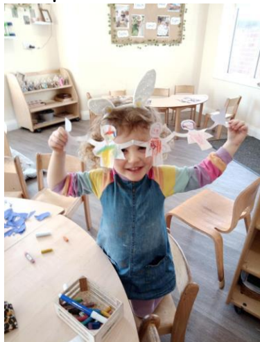
We created paper dolls