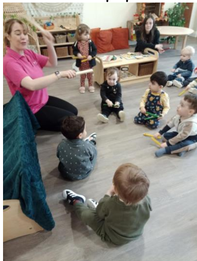
Caterpillar music fun