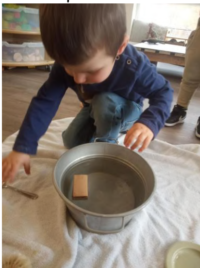
Exploring sinking and floating