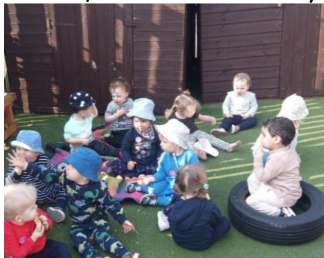
Bumbles and Honeys had a picnic in the garden!