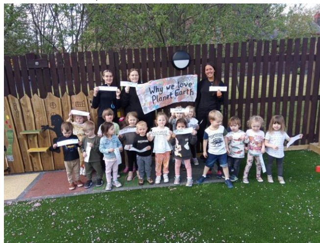
Our preschool room have been learning all about how we can care for our planet in celebration of Earth Day, they each got to share why they love planet Earth so much!