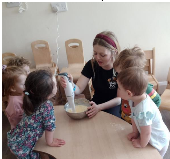
Busy Bees also enjoyed a trip out in the turtle bus where they got to choose their own fruit which they created their own healthy smoothies with!