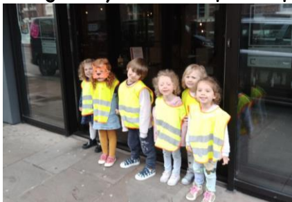
Visiting the theatre to watch "The tiger who came to tea"