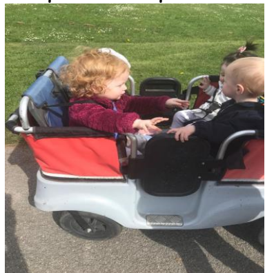
A visit to the park for a picnic