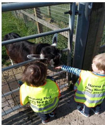
A visit to Acorn farm