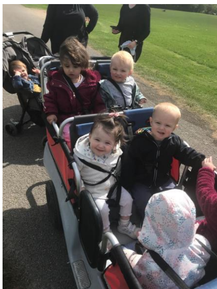
Bumble's and Honey's have each enjoyed a trip out this month. Bumble's celebrated Earth Day with a walk around the park and enjoyed a picnic. Whereas our Honey Bees enjoyed a trip to the farm!