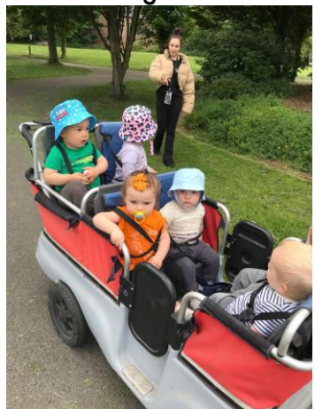
On the look out for bees!