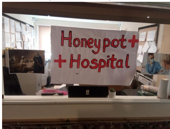
Our preschool room have role playing in the Honey Pot Hospital for International Nurses Day. They loved taking care of each other and learning why nurses are so important.