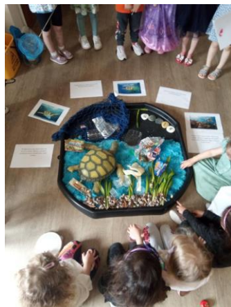
Discussing plastic pollution!