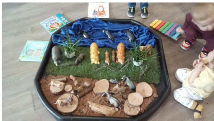
On Endangered species day Honey Bees explored a tuff tray looking at endangered animals across the world.