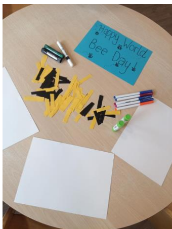
Bumbles have been working on their fine motor skills and coordination while creating their own collages on World Bee Day!