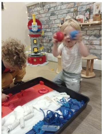
Celebrating the Jubilee!