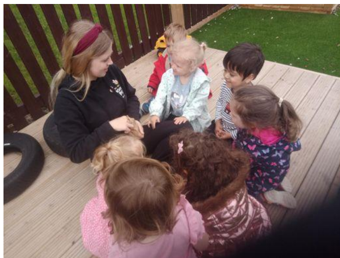
Busy Bees enjoyed learning about Bees on World Bee Day and planting seeds that will turn into a wildflower meadow.