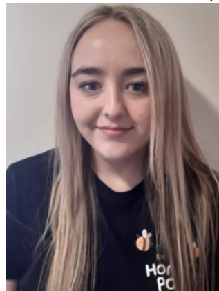
Well done and Thank You.