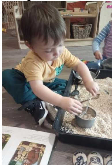
Practicing our gross motor skills!